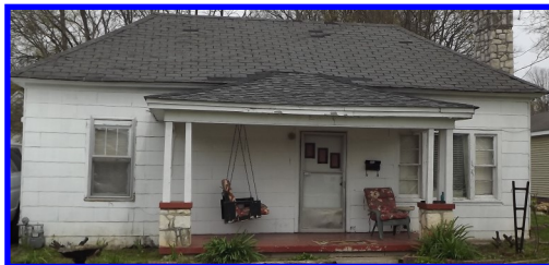
1315 KENTON - SELLING @ 10AM

A 7% BUYERS PREMIUM WILL BE ADDED TO FINAL BID ON EACH PROPERTY TO ESTABLISH CONTRACT PRICE. TAXES: 2018 TAXES WILL BE PRORATED FROM DELIVERY OF DEED. POSSESSION WITH DEED SUBJECT TO TENANTS RIGHTS. ALL PROPERTIES WILL BE SOLD AS IS. THIS AUCTION IS NOT CONTINGENT ON FINANCING. MAKE YOUR FINANCIAL ARRANGEMENTS PRIOR TO BIDDING. AUCTION BANNERS POSTED.