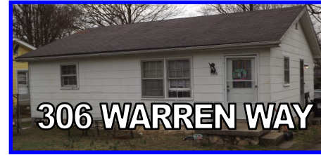
306 WARREN WAY

253, 303 & 306 - SELLING @ 11A.M. from 306 Warren Way