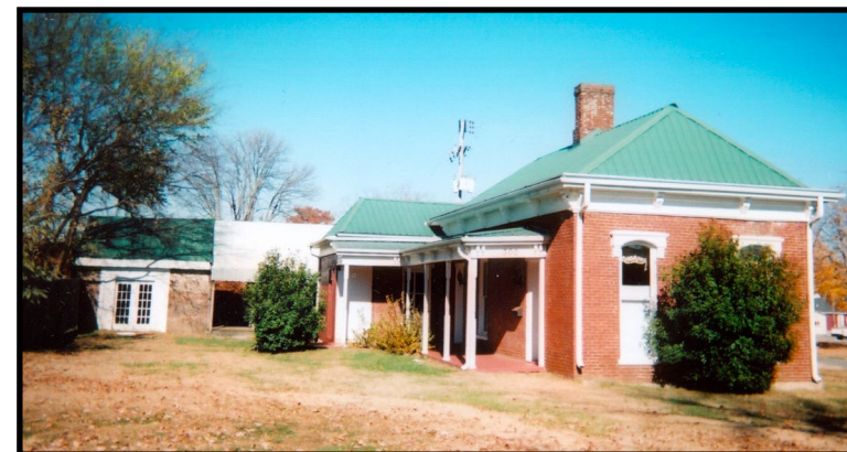
SALE #2 300 W. KY. AVE.